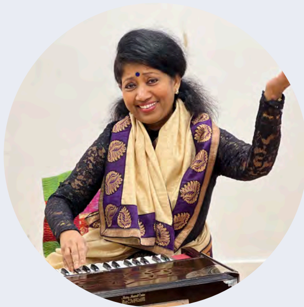
Image: Musician workshop and performance

KS3, KS4, KS5 Musician Residency (1 day) 2 assemblies + a 90 minute session with your music group, £485